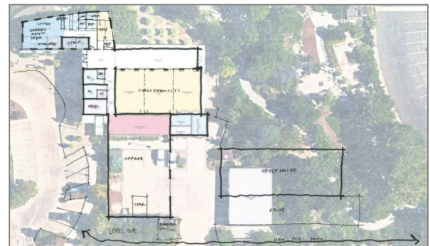
Garden Park layout